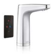
XR Remote Dispenser