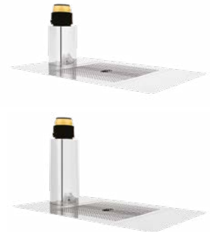
70mm & 120mm riser and font*

* Optional matching riser and font accessories available for XL Levered, XT Touch & XR Remote Dispensers.